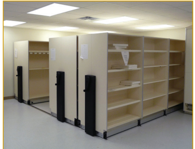
Speciality Medical Cabinet Storage