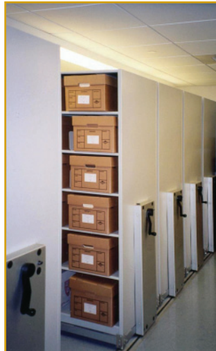
Archival Record Storage