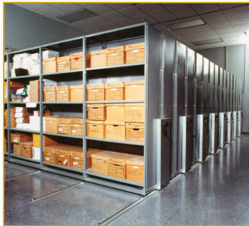
Archival Record Storage