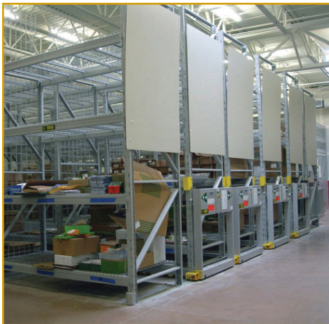
Large Stock Storage