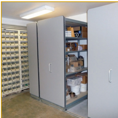
Manual Mobile System