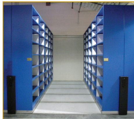
Mechanical-Assist Mobile System