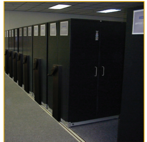
Engineering Files Storage