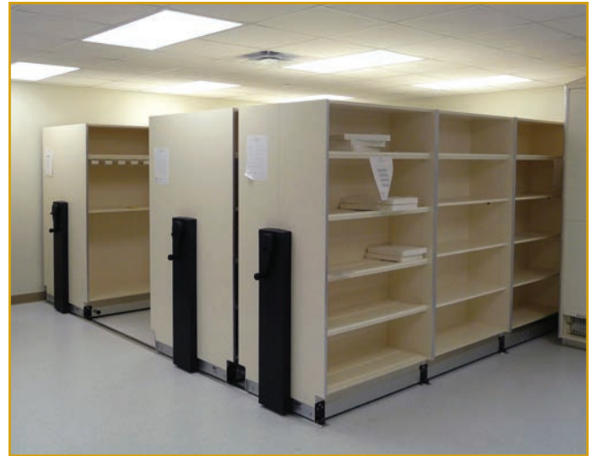
CATH Department Storage