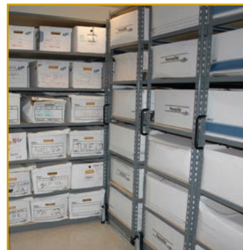
Archival Record Storage