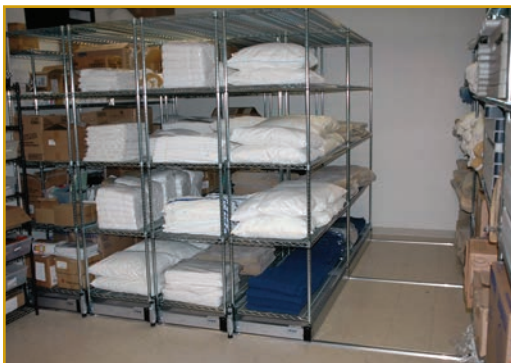
Linen & Supply Storage