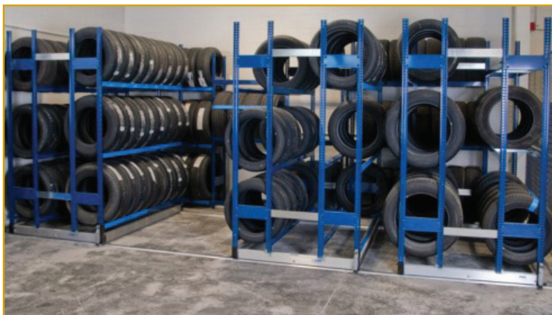
Manual Mobile System