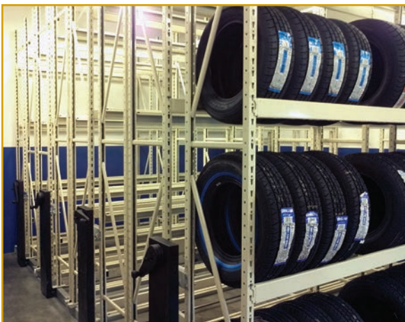
Tire Rack Storage