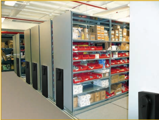
Tools, Parts & Supply Storage