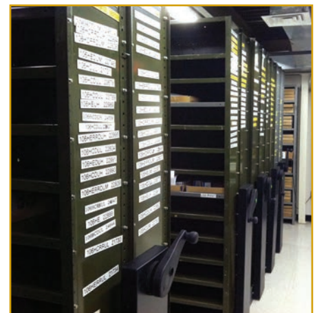
Mechanical-Assist Mobile System