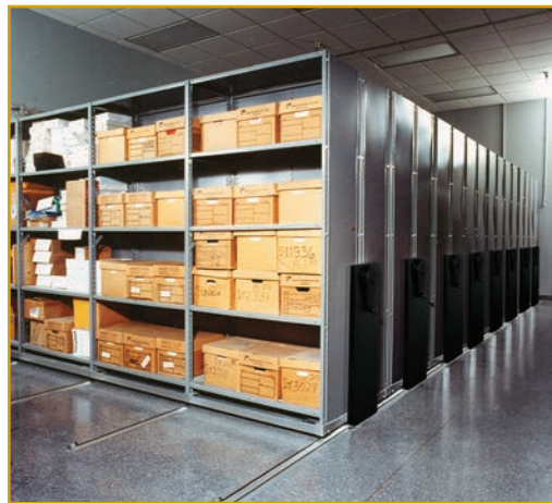
Archival Record Storage