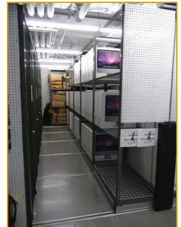
Parts & Bulk Storage