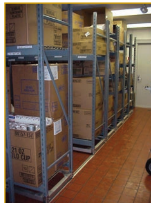
Heavy Duty Manual Mobile System