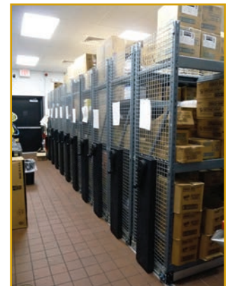
Mechanical-Assist Mobile System