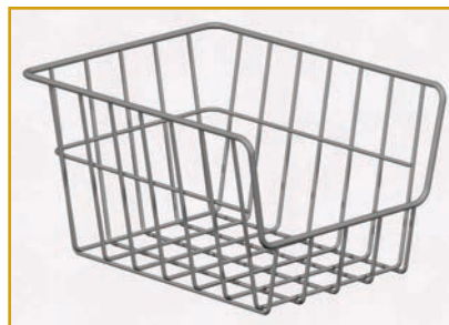
Shelf Lips, Bins & Baskets