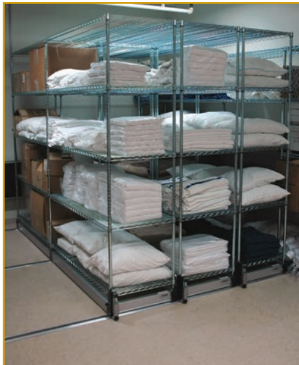
Table Linen Storage