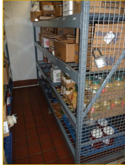
Dry & Cold Food Storage