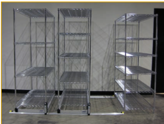
Manual Mobile System