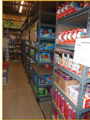
Small Box Storage