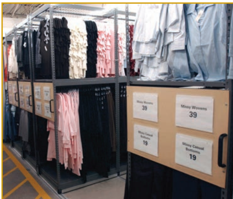
Manual Mobile System