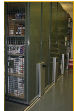
Secured Electronics Storage