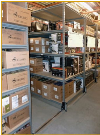
Small Appliances Storage