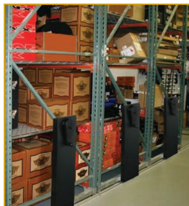
Mechanical-Assist Mobile System