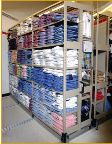
Fold & Hang Apparel Storage