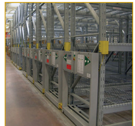
Electrical Mobile System