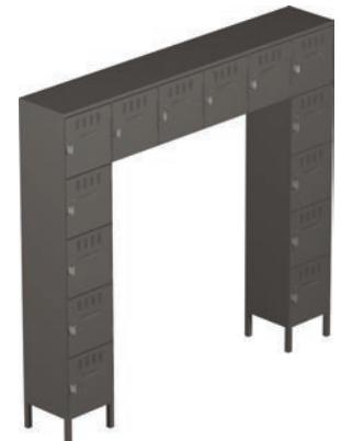
16 Person Configuration