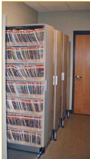
Manual Compacting Mobile System