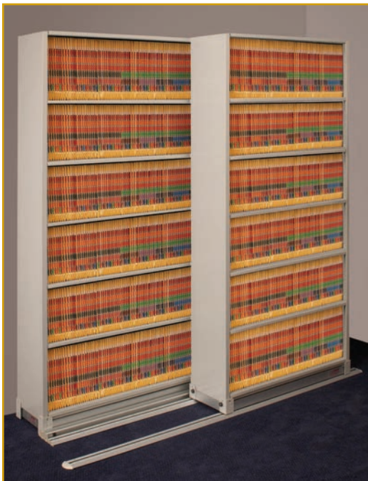
Lateral Mobile System